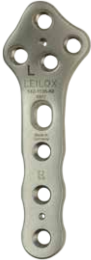
LeiLox TPLO Locking Plate, 3.5 mm, left, 75 mm, stainless steel