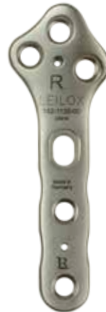
LeiLox TPLO Locking Plate, 3.5 mm, rechts, 66 mm, stainless steel