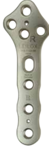
LeiLox TPLO Locking Plate, 3.5 mm, right, 75 mm, stainless steel