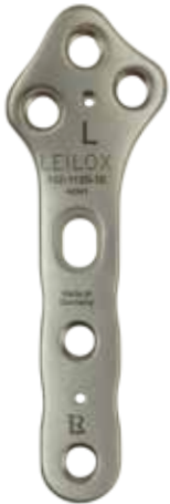
LeiLox TPLO Locking Plate, 3.5 mm, left, 66 mm, stainless steel