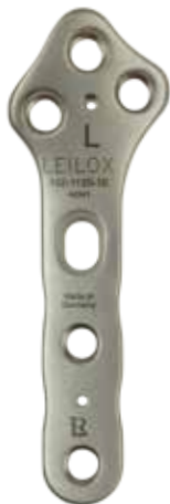
LeiLox TPLO Locking Plate, 3.5 mm, left, 66 mm, stainless steel