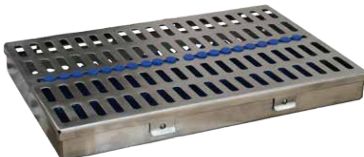
[28] Instrument Cassette #20 for 20 instruments