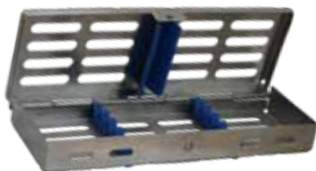
[26] Instrument Cassette #5 for 5 instruments