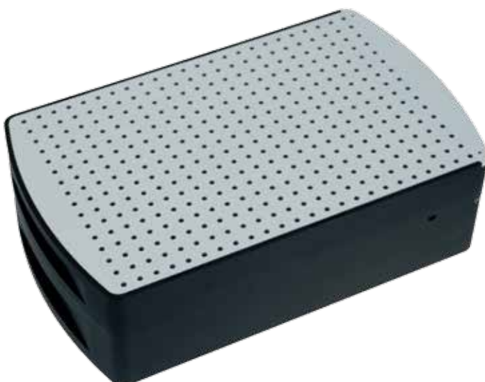
TTA Instruments & Implants BOXES