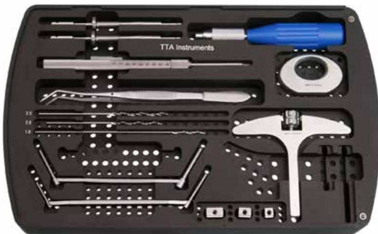
TTA ESY Instruments BOX