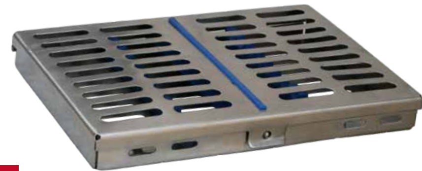
[28] Instrument Cassette #20 for 20 instruments