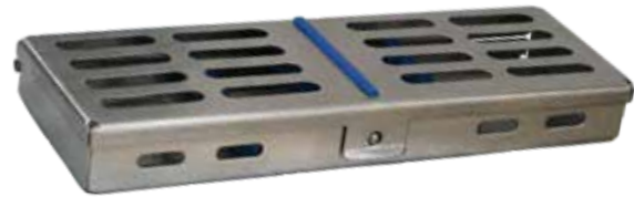
[27] Instrument Cassette #10 for 10 instruments