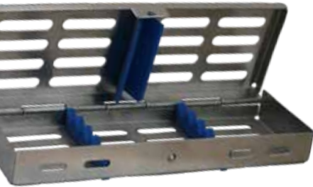
[26] Instrument Cassette #5 for 5 instruments